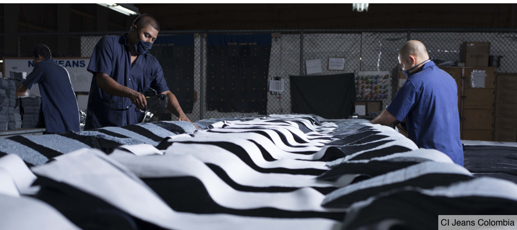
CI Jeans Colombia