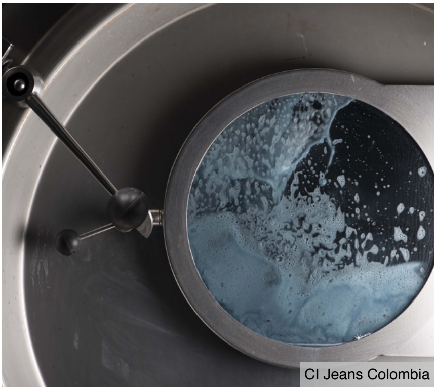
CI Jeans Colombia

The Denim Garment Sourcing Guide is a curated selection of essential denim manufacturers to watch out for. In building this guide, we focused on manufacturers that service international clients, invest in advanced technologies, and those making strides to adopt sustainable practices. This guide aims to outline their capabilities, capacities, stability and unique specialities. A new report to WGSN, this Garment Sourcing Guide will be provided seasonally to keep you informed.